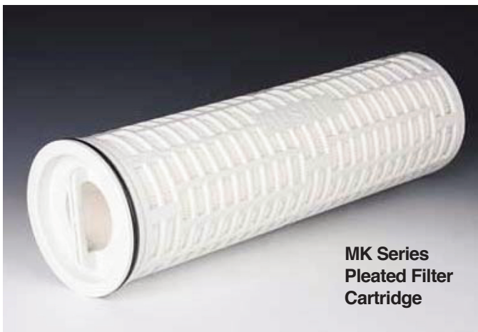
MK Series Pleated Filter Cartridge